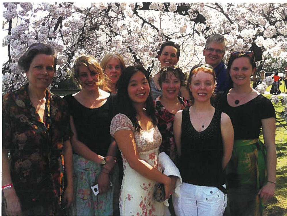
Here's some of the NRC Staff "springing forward" at the peak of the cherry blossoms in Washington, D.C., April 2013.