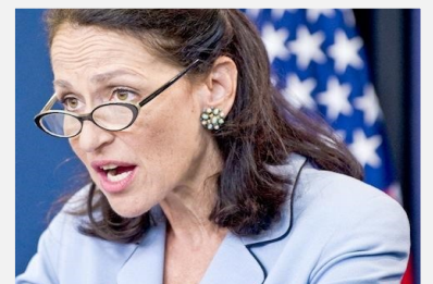
FDA Commissioner Margaret Hamburg

Our keynote speakers were Rep. Rosa DeLauro (D-CT) , a strong voice for patient and consumer safety, and FDA Commissioner Margaret Hamburg , whose dedication to the FDA as a public health agency has been sorely tested by Congressional pressure to approve drugs and devices more quickly with little regard for safety. Congressional calls to “support innovation” and “reduce the burdens on companies” can result in a higher burden on physicians and their patients, who too often need to make potentially life-saving decisions regarding enormously expensive new treatments on the basis of completely inadequate information. ♦