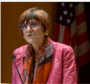
Rep. Rosa DeLauro (D-CT) at our “Evidence for New Medical Products” conference.

Scientific research has the power to improve the lives of patients across the country and around the world, but too often that research gets drowned out by competing information. As a result, patients, physicians, policy makers, and other opinion leaders miss out on important information that can save lives.