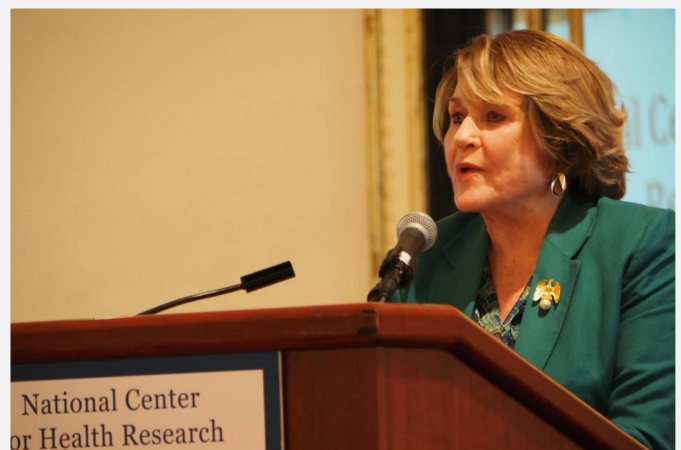
Congresswoman Louise Slaughter (D-NY)

Congresswoman Louise Slaughter (D-NY) delights in taking on the fights no one else will, which made her a perfect fit for our Foremother Award. As a powerful and unique Member of the U.S. House of Representatives who is serving her 14th term, Rep. Slaughter joked, "they don't call me Slaughter for nothing." As the only Member of Congress with a degree in microbiology, she has played a central role in the major health and science issues of our time, achieving landmark legislation such as federal funding for research on the synthetic hormonal drug DES, the inclusion of women and minorities in clinical trials, and increased federal funding for breast cancer, at a time when virtually no NIH research was being done on cancers that primarily affect women. As Slaughter stated, "We lost a Vietnam Wall full of women every single year to breast cancer. And absolutely nothing at that time was being done about it."